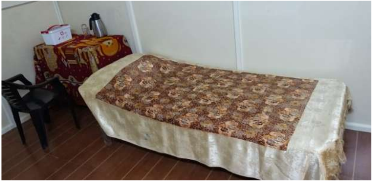
First Aid Medicine Chest